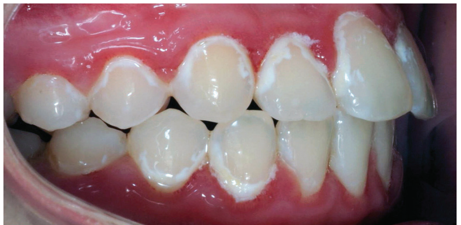
WSLs - We are seeing the wider use of sealants, such as Opal Seal, as a measure to protect enamel and avoid white spot lesions during orthodontics.

slot was introduced to reduce force levels when only steel or gold wires were available, and before we had today's range of nickel-titanium options. A show of hands indicated 99% of the doctors in the London and Manchester programs were in the 0.022 slot.