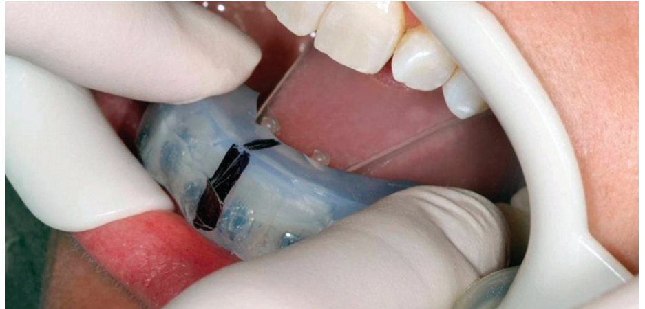
IDBS - Indirect bonding provides for greater accuracy in bracket positioning, a more comfortable patient experience, and more effective use of 'doctor time'.

Anyone visiting the London practice or Dr McLaughlin's beautiful new practice in San Diego, will find Indirect Bonding Systems (IDBS) being used, and this method has been favoured for more than five years. However, a show of hands at the recent courses indicated that fewer than 2% of the audience were placing brackets by IDBS. There are big advantages to making this switch, because it provides for greater accuracy in bracket positioning, a more comfortable patient experience, and more effective use of 'doctor time'. Along with a demand for more accurate brackets, I expect to see the wider use of sealants as a measure to protect enamel and avoid white spot lesions (WSLs) during orthodontics. Instead of etching a small enamel area for the bracket base, the whole labial surface can be etched and sealed with a top quality sealant such as Opal Seal, which can be expected to absorb and release fluoride ions. There is a continual move in favour of the 0.022 slot and I expect the 0.018 slot to be abandoned in the next few years. The smaller